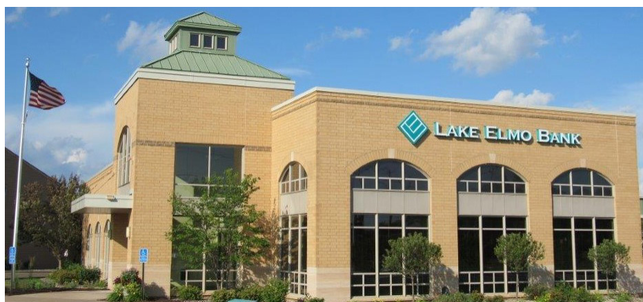
LEB Stillwater Office

Thank You for selecting Lake Elmo Bank as the "Best Bank" in the valley. Thanks to all who voted and a special thank you to our employees who make this recognition possible. We are proud to be a part of this community and will continue to work daily to fulfill our mission of providing personal service to each of our customers.