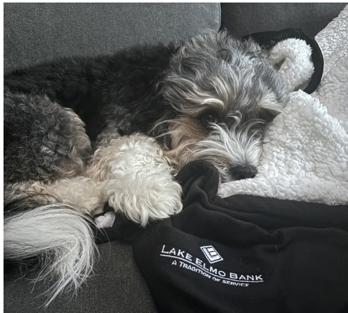
Anna Corman's Bernedoodle, Quinn, comfortably napping on an LEB blanket.

Send your pictures to cclark@lakeelmobank.com . Please include your name and location of the pic.