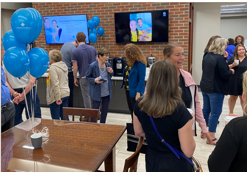
Guests enjoyed refreshments from Great Harvest and Sunshine Coffee.

"The Vault" ~ named by our employees, is our newly renovated employee lounge in our Lake Elmo Office. The large kitchen area includes two refrigerators, ice maker, spacious island and a stocked snack pantry providing all the conveniences for those employees who wish to enjoy their lunch on-site. Booth seating and a couch/tv area offer comfortable space for breaks, conversation or small group training. This was a popular space this month as employees gathered to watch the Summer Olympics.