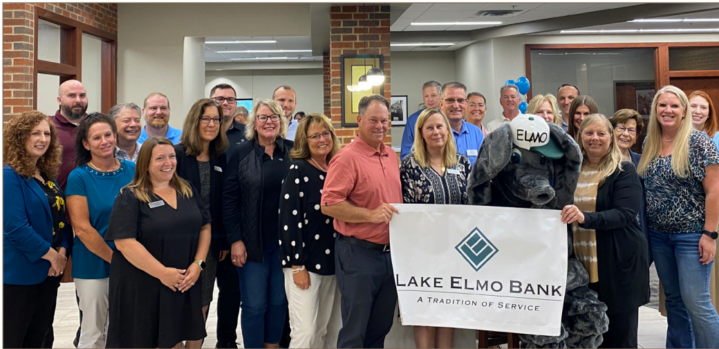
LEB employees participated in the Stillwater Area Chamber's ribbon cutting as we celebrated the newly renovated Lake Elmo Office.

After a year of construction, the renovations on our more than 30-year old building are nearly complete. A community open house earlier this month, along with a ribbon cutting ceremony welcomed customers and community friends in for refreshments and a tour of the building.